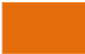
SUNFLARE ORANGE PEARL