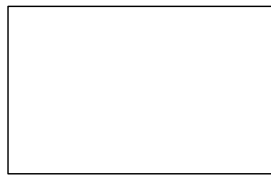
WHITE DIAMOND* [Surcharge of RM800 is applicable]