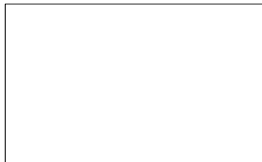
WHITE DIAMOND* [Surcharge of RM800 is applicable]